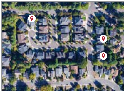
All 3 homes located in the same neighborhood